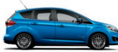
Blue Candy Tinted Clearcoat Metallic