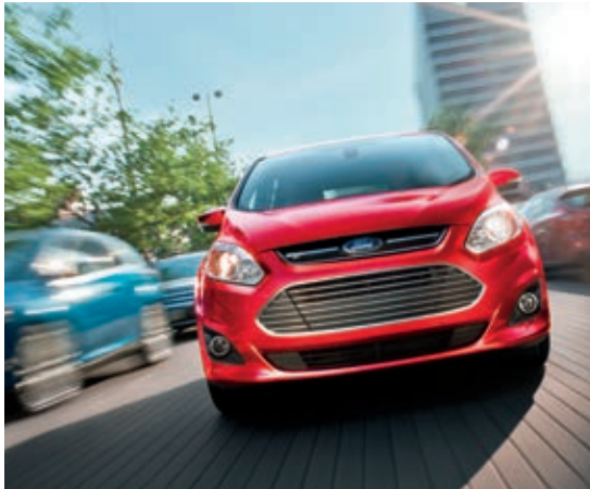
Ruby Red Tinted Clearcoat Metallic. Available equipment.