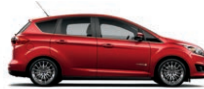
Ruby Red Tinted Clearcoat Metallic