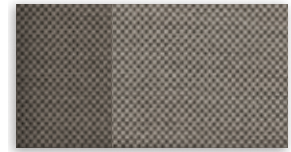
1 Medium Light Stone Cloth with Medium Dark Stone Accents