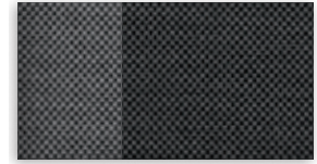
2 Charcoal Black Cloth with Warm Steel Accents