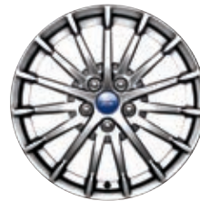
17" Machined Aluminum Standard

Ford has teamed up with SunPower® to offer a rooftop solar system that provides clean, renewable energy for use throughout your home. It's another smart step you can take in your commitment to green living. Right now, this offer has been extended to Ford hybrid and plug-in vehicle drivers. 3 To sign up for a free, no-obligation home evaluation, visit sunpowercorp.com/ford or call 1-800-SUNPOWER.